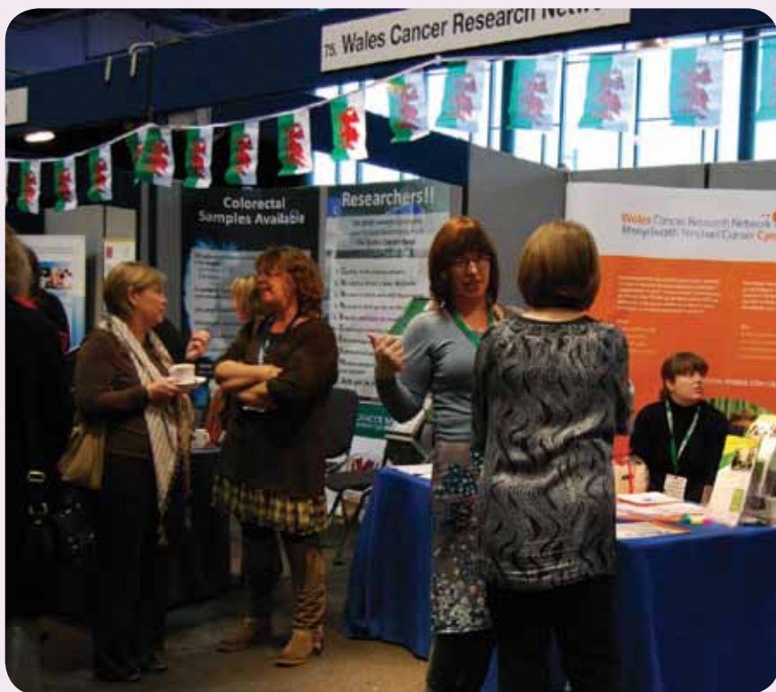
The Wales Cancer Research Network exhibition stand at the NCRI Cancer Conference

In January 2003 a meeting was called to discuss the formation of a Wales Cancer Bank. This meeting was attended by a group of consumers and professionals and this mix was the template for the way in which all further decisions would be made.