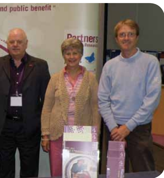
CLG members at a lung cancer conference