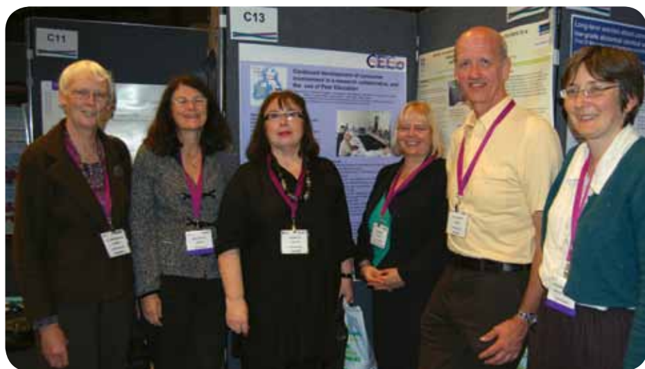
Consumer members (research partners) presenting their poster at an NCRI Cancer Conference

and shows how the consumer voice in the research process can make sure studies are presented to patients in the way they find most helpful thus ensuring success.