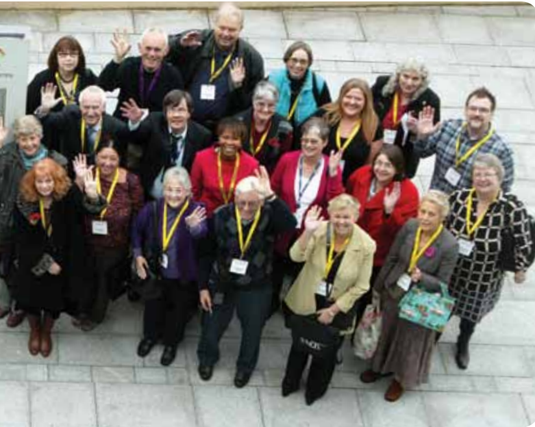
Patients and carers to attend the annual NCRI Cancer Conference

Research Network involve consumers in the development and delivery of research. Consumers, in this context, are defined as ‘patients, carers and members of the public whose lives have been affected by cancer’.