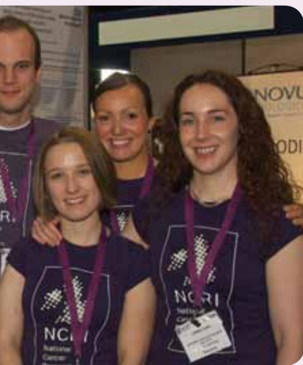
... (far right) at an NCR Cancer Conference

participatory research to describe young people's experience of cancer care, the Core Consumer Group facilitated a one day workshop and were involved in the analysis and writing up of results. Their contribution was invaluable for funding of the larger study BRIGHTLIGHT 3 . Participants in the workshop expressed the benefits of having other patients working as co-researchers: