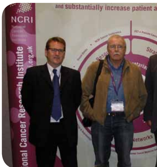
Raising awareness of PPI in cancer research –