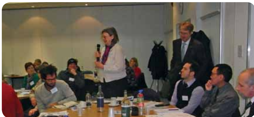
Consumers at a Liaison Group meeting

The aim is to maximise the benefits of research to patients and the NHS through active, inclusive and co-ordinated patient and public involvement.